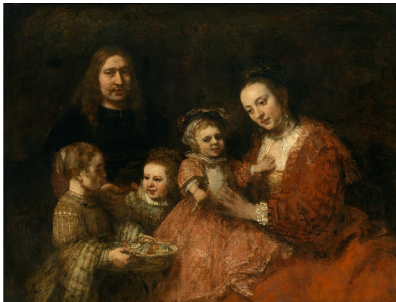
Figure 1: The Family Portrait – Rembrandt – ca. 1665.

At the end of his career in ca. 1665 Rembrandt painted the Family Portrait (see figure 1), that is famous for the exceptional “warmth you sense between the subjects of the family”. 69 This seventeenth century painting closely resembles what nowadays would be considered the nuclear family. Intra-familial relationships (including between siblings) are portrayed in a positive manner. It should be understood that for the 17 th century, it was truly rare and exceptional that such a warm family life was observed: with child mortality rates being one in two children and children being sent to work or apprenticeships already at the age of seven, there was little time for siblings to bond. 70 Over the last centuries, however, a lot has changed in family life, with decreased child mortality having the most extensive effect on intra-familial relationships. 71 During the Enlightenment, with increasing life expectancy, gradually childhood became longer and schooling was introduced, changes that allowed minor siblings more than ever to live together and share real experiences. 72 Since then, children have had the possibility to develop sibling relationships throughout their childhood. This chapter will provide an overview of the significance, risks and valuable aspects of sibling relationships from a mostly psychological point of view.